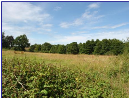
View from Rear Garden